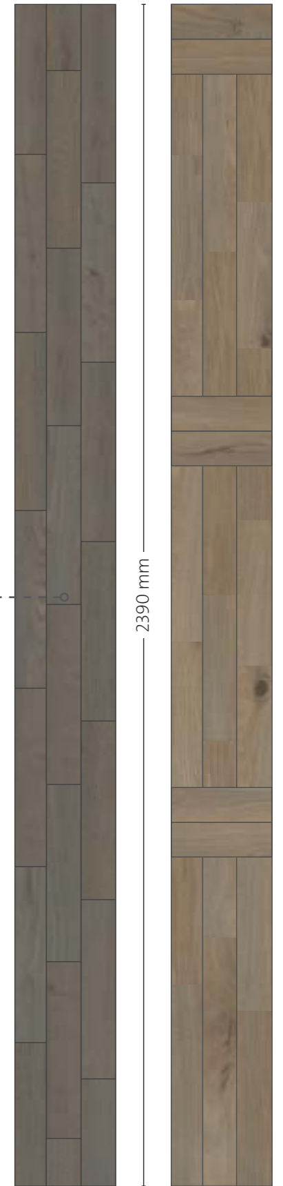
Contura basket weave