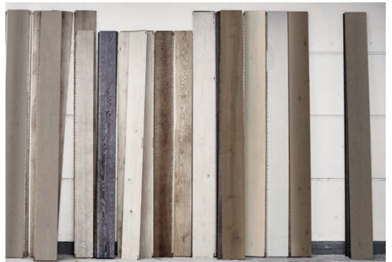
The colours of the Heaven and Earth Collection are also available as herringbone and system planks from the Flemish Heritage Collection (page 44-47).