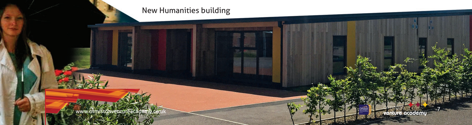
New Humanities building