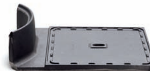
Heat Conducting Plates Direct heat from the barrel to other areas of the AGA. The heat conducting plate from the barrel to below the roasting oven means the oven floor is wonderfully hot for authentic pizzas, moreover apple pies have a crisp browned base, even in a ceramic dish.