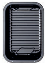
Roasting tin & grill rack