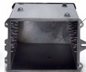
Simmering Oven Long, slow cooking in the simmering oven develops flavours and makes the toughest meat tender. Its large capacity means several pans can be stacked here.