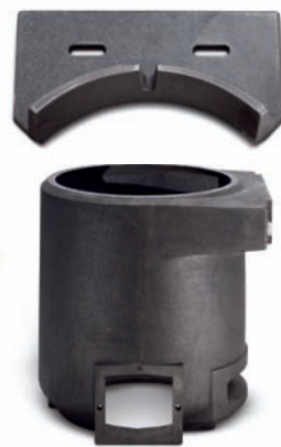
Barrel This magnificent barrel of cast-iron is the heart of your AGA. The heat storage principle is simple, tried-and-tested and designed by Nobel award winning scientist and inventor, Dr Gustaf Dalén, over 80 years ago.