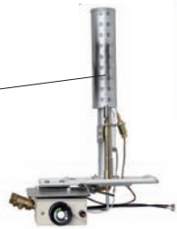
Gas Burner The principles of AGA cooking are the same whatever the heat source.