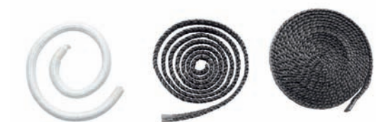
Rope Seals Special 'ropes' to ensure air tight seals and joints.