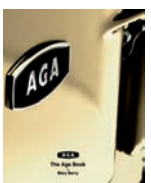
The AGA Book