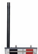
Heat Indicator Attached to the top of the roasting oven the heat indicator shows the amount of stored heat in the AGA.