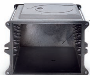
Baking Oven A moderate oven for cooking cakes and biscuits, baking fish, lasagne or shepherds pie.