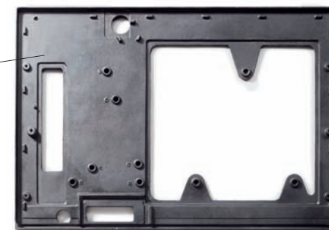
Base Plate Everything needs a good foundation. The AGA base plate is the start of the AGA build, providing a level surface for the assembly.