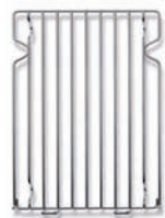
Oven Grid Shelf