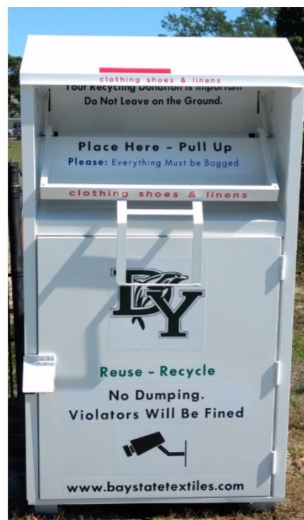
Collection box located outside of each Dennis-Yarmouth Regional School

In any condition, 95% of all textiles can be recycled or reused 45% of textiles collected are reused, the good is NOT shredded!!!