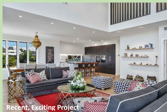
Recent, Exciting Project