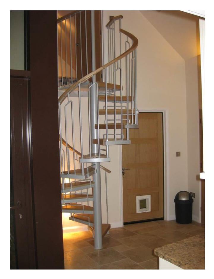
Internal Spiral Staircase