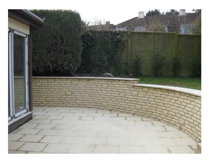
Curved garden walls & patio