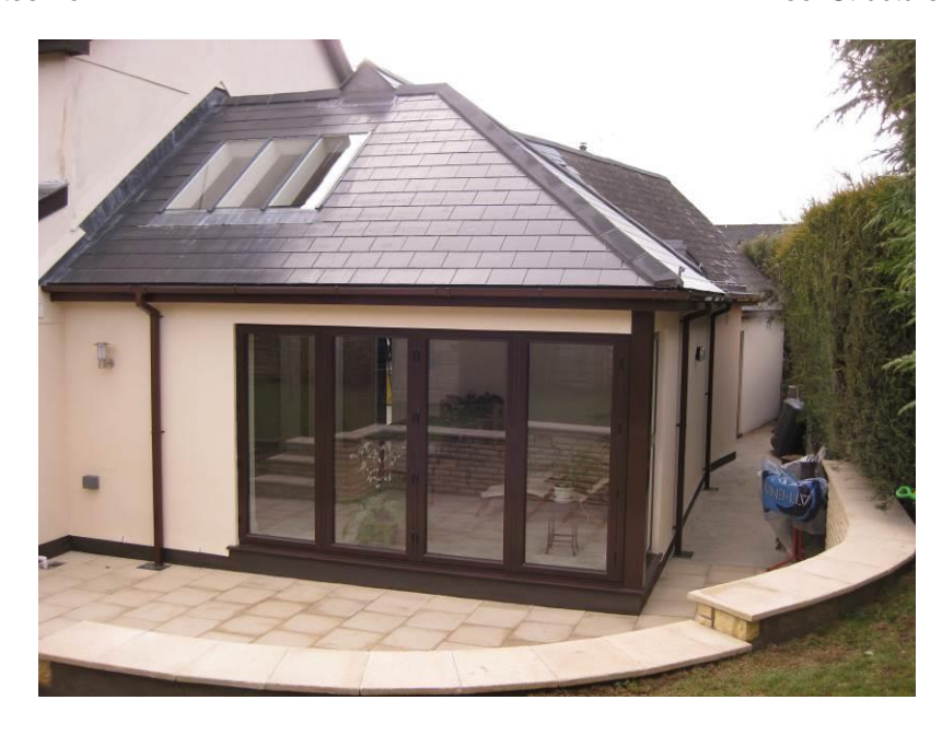
Rear elevation of extension