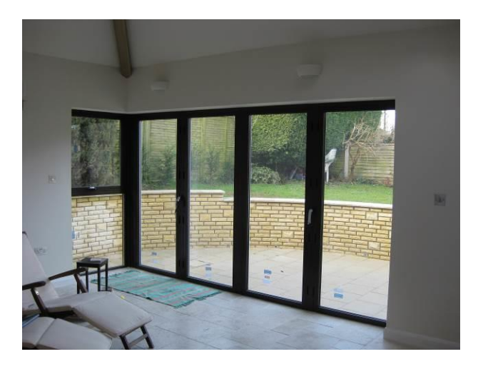
Bi-fold sliding doors leading to patio