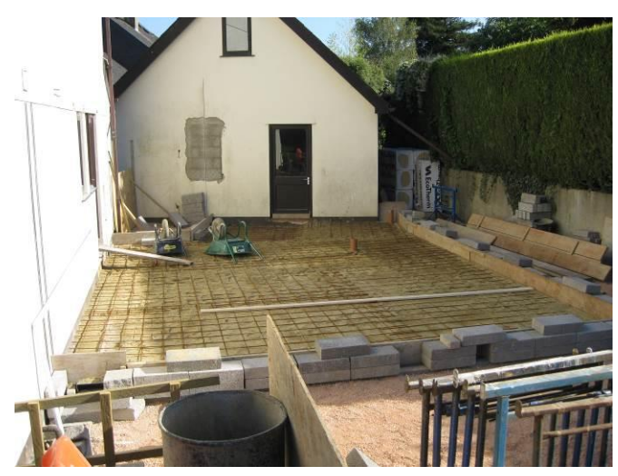
Reinforced Concrete Slab