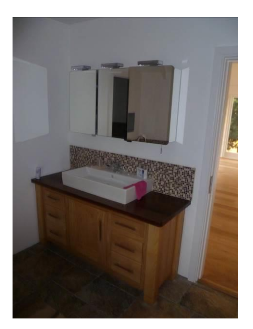
Master en-suite (2)