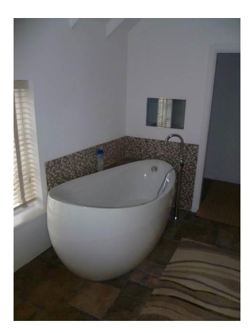
Master en-suite (1)