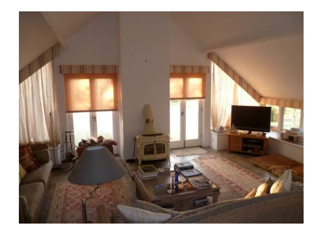
Second living area