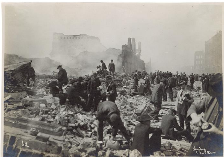
The San Francisco quake of 1906 left 300,000 people homeless. California has more than a 99 percent chance of another major quake happening in the next 30 years.