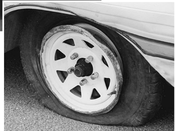
Wheel Alert - It could save your life.