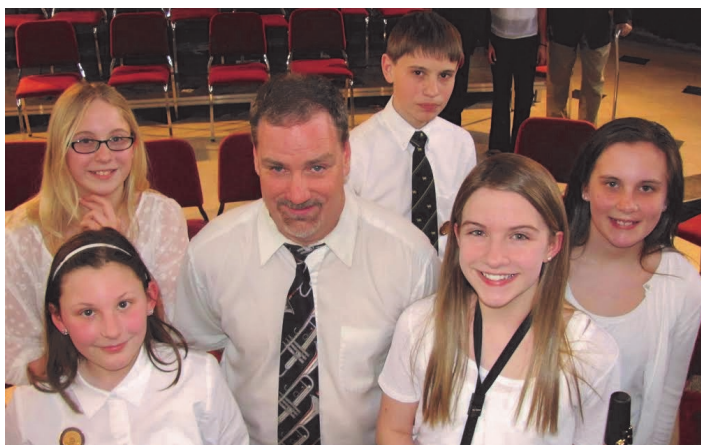
Pictured above are St. Rose Honor band students who performed at St. Mary's Chapel, Villanova University on March 28, 2015.