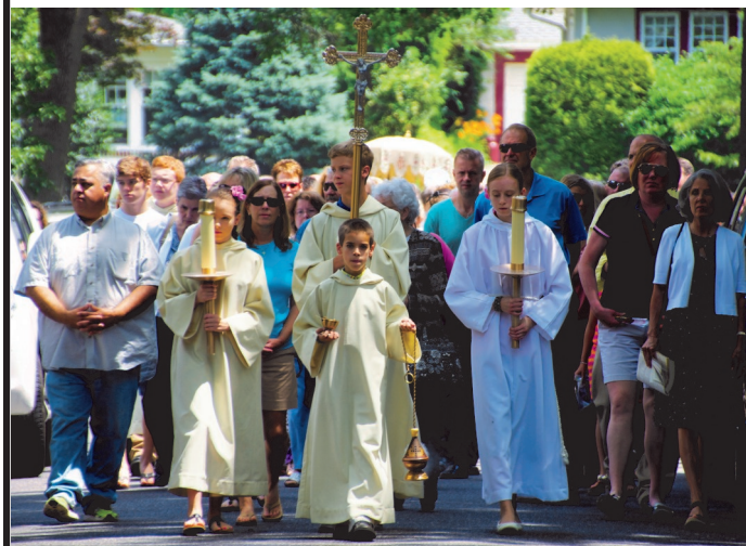
Corpus Christi Procession 2014