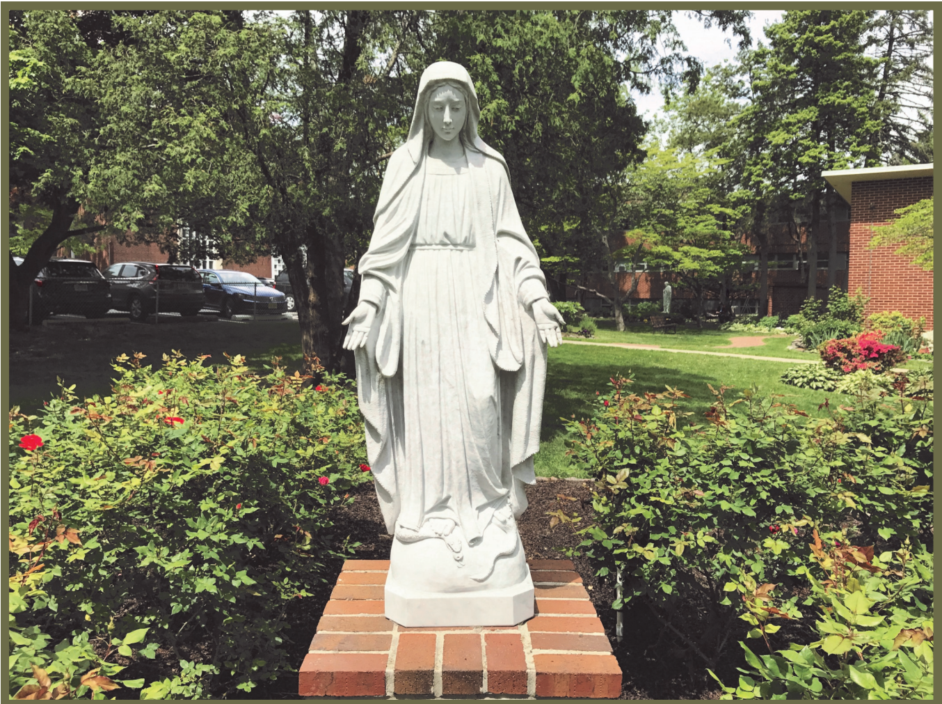
St. Rose of Lima Rose Garden