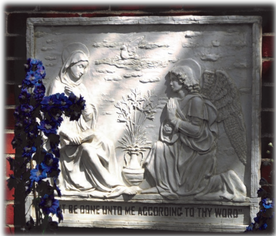
Picture from our St. Rose Gardens

Happy Mother's Day, Mary, Mother of God and Mother of us all!