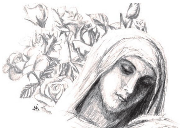
Artwork © by Jef Murray