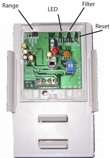
Figure 1 PIR with cover removed