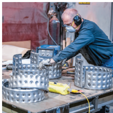
ASME Certified Welding Services