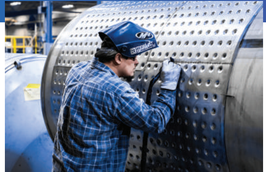
Need Help Welding Dimple Jacket To Shells? We Do It Daily.

Why do so many busy manufacturers in the tank & pressure vessel industries turn to CMPI? Because our ASME certified master welders and fabricators have the skills required to assist with your custom build, and our reputation for speed and accuracy is renowned throughout the midwest. We make your job easier.