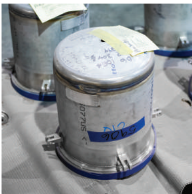
Custom Parts & Pieces Fabrication