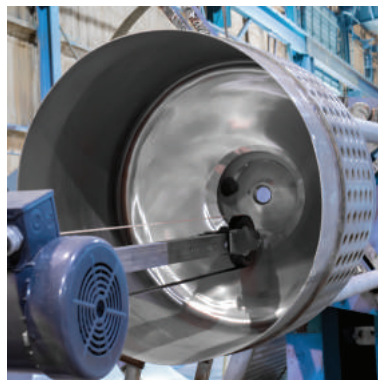
Polished Tanks & Tank Components