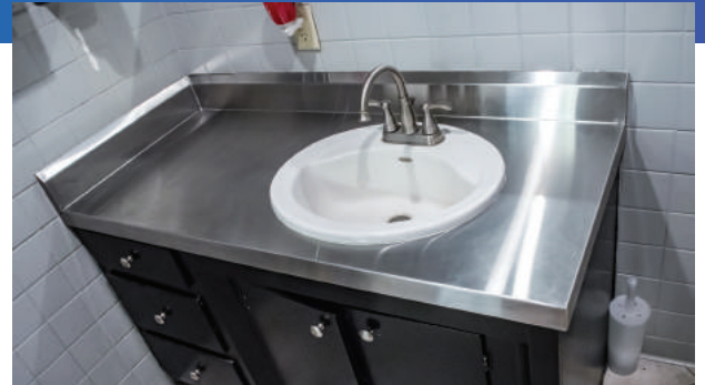
Stainless counter-tops are sanitary and easy to clean!

Ornamental stainless fabrications for architecture are our speciality! We make custom fitted counter-tops, casework, and cladding, polished by our experts. and when you need it, we install our products on-site. We also offer stainless joggle seam wall cladding for kitchens.