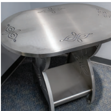
Custom Polished Stainless Steel Table