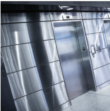
Polished Stainless Wall Cladding

Whether you require a unique fabrication to furnish your site, or something simple like stainless cane rail or cornerguards, we take care of every step, from material purchasing to installation.