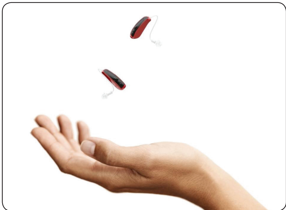
ReSound's 2.4GHZ wireless technology is the industry's most advanced wireless communication system.

utilizes top-of-the-line wireless technology, also boasts unique features, including one called Places. This feature connects with the iPhone's global positioning system to save specific hearing aid settings in connection with certain locations.