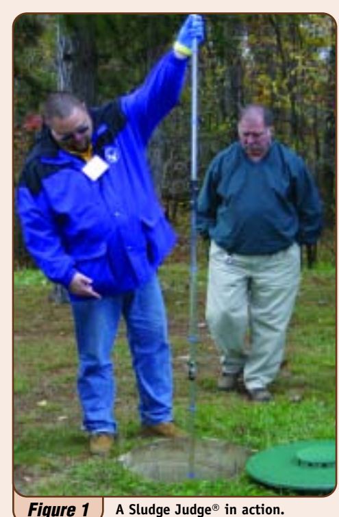
A Sludge Judge® in action.

When a septic tank is inspected for solids accumulation, a certified inspector will use an instru-