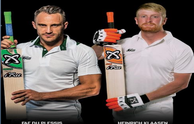
FAF DU PLESSIS