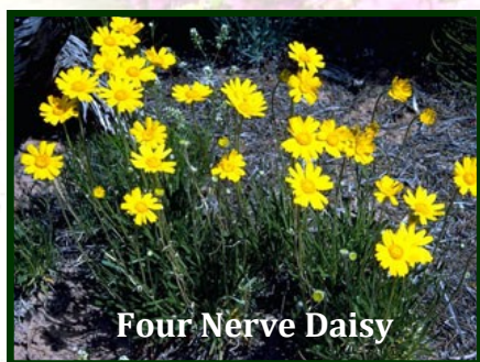
Four Nerve Daisy

When you plant well-adapted plants they perform and are happy. As gardeners, when we go around our yard and we see them blooming, we are happy. The other day doing my spring cleanup, I noticed my Four Nerve Daisy had dozens of seedlings coming up. This little plant is happy enough to bloom and raise a family in my front yard. It's the little things that can bring gardening happiness. Come visit us this spring. Mother Nature needs more happy gardeners!