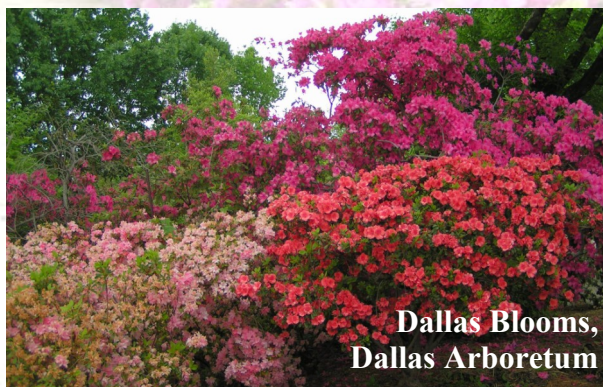
Dallas Blooms, Dallas Arboretum