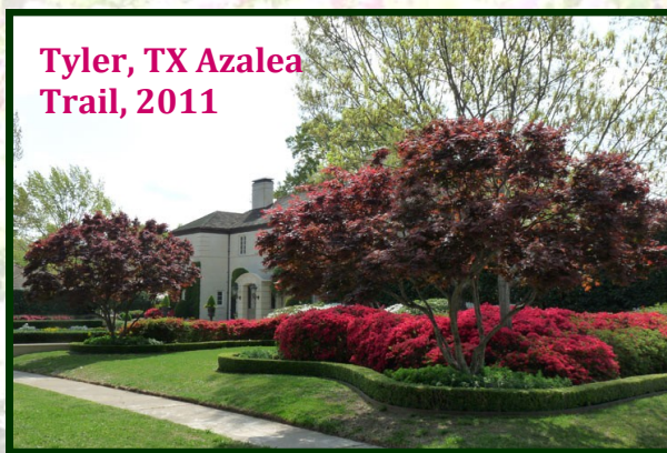
Tyler, TX Azalea Trail, 2011