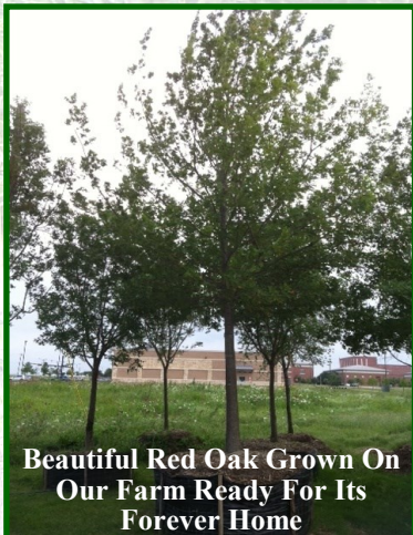
Beautiful Red Oak Grown On Our Farm Ready For Its Forever Home

It's important for the sapling to begin with a strong central leader so the tree will grow straight up over time. Next comes the cultural practices of trimming the trees to assure maximum growing conditions. One of the biggest challenges is keeping the tree staked with our prevailing, strong winds; one day from the North then from the South the next day. Usually we don't start trimming until the second year with a little directional trimming. Once the trunks are about the diameter of a broomstick, we can remove the stakes. The following year we start to trim the lower branches so we have a clean trunk to 4 feet. By this time, our baby saplings are 4-5 years old and ready to harvest at 3" caliper (diameter of the trunk 6" off the ground). From that time forward they usually grow another caliper inch each year.