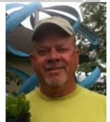
By Jeff McCauley

Cultivating a "Better Tree" takes a lot of skill and dedication plus a little bit of luck! First, the grower must insure that the baby trees are true to variety. We have seen problem trees that were supposed to be Red Oaks but were actually some sort of mix of Pin Oak or Nuttall Oak. Unfortunately, these like sandy acidic soil which is common in East Texas. In our black alkaline soil they will be a sickly pale green, never grow well and slowly die. If you have one of these, it's not your fault, they look very similar to the untrained eye.