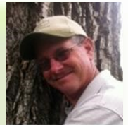
By Rob Wier

On January 1, 2013 we updated our warranty to 30 days on plants. And we provide a 1 year warranty on trees that we plant.