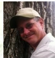
By Rob Wier

We are lucky to have a large number of berry producing plants that thrive in our area. They provide winter food for the birds and other critters, and add a splash of color and interest to our gardens too! Test your gardening knowledge and fill in our mix & match quiz—match the picture to the berry producing plant name. We will even get you started with the first answer. Email your answers to info@shadesofgreeninc.com by lucky Friday, December 13, 2013. Everyone with 10 or more correct answers will receive a $10 OFF any purchase coupon. Look for your coupon in your inbox and the correct answers on our Facebook page Monday, Dec 16. Good luck!