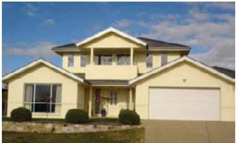
Right: After, extension with the addition of a second level