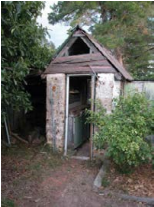
Left: Heritage listed, from the outside looking in Below: After, inside looking out