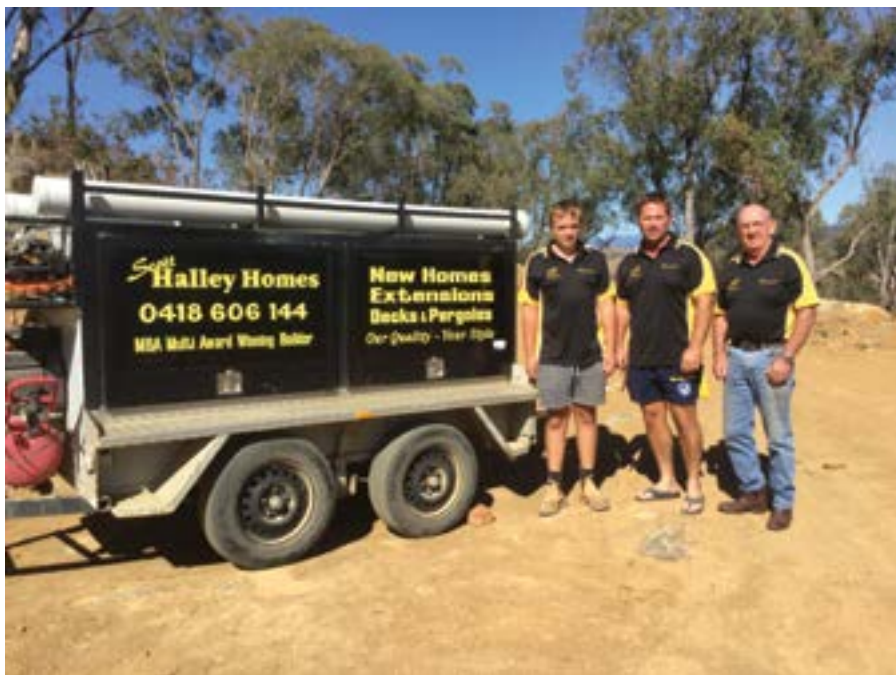
Three generations of experience in the local building industry

With our long period in the building industry we are fortunate to now see a number of repeat customers which is strong testament to the bond we have formed through the building process.