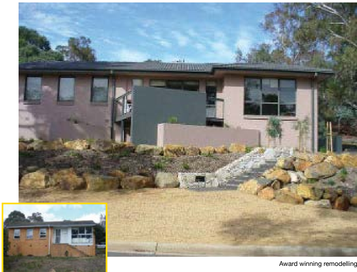
Award winning remodelling