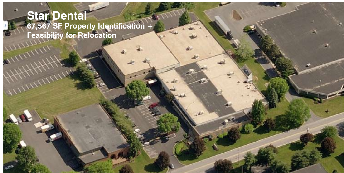
Star Dental 67,567 SF Property Identification + Feasibility for Relocation