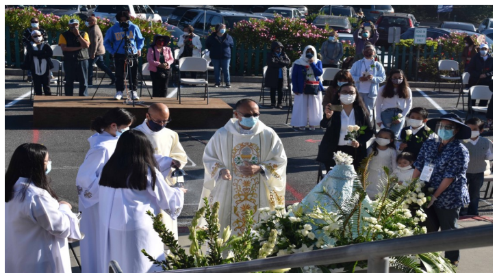
Culmination of the Holy Rosary/Mass, Coronation & Floral Offering