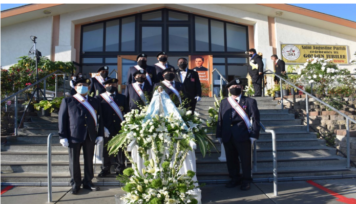
Procession of the Blessed Mother with the Knights of Columbus

Catholic Household Blessings and Prayers , revised edition (Washington, DC: United States Conference of Catholic Bishops, 2007). The "Prayer After an Election" by Cardinal Adam Maida, Archbishop of Detroit, is used with permission.