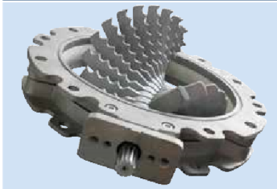
LUMP BREAKING FEEDER VALVE aiding material flow