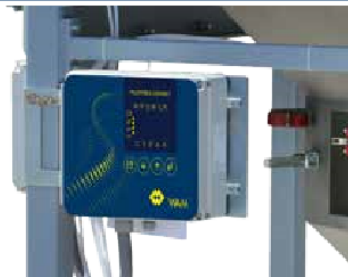
ELECTRONIC CONTROL PANEL individually programmable according to specific material properties