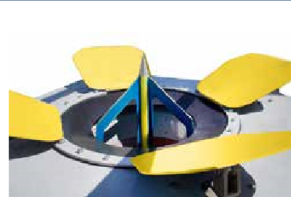
CUTTING KIT 3-blade configuration enhancing cutting performance