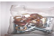
2 Chain Hooks