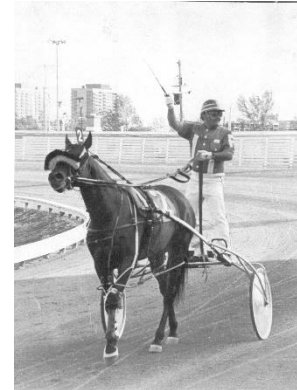
Quebec's Herve Filion, won over $88 million as a driver- 1970's-2000's.