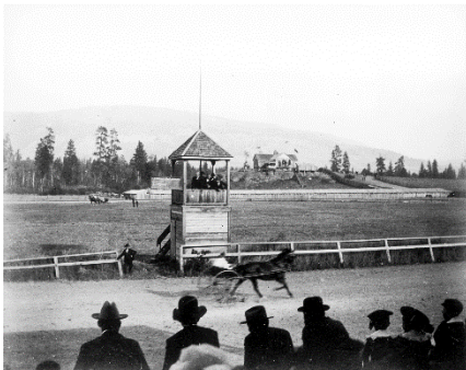
Kin Park, Vernon, BC - 1902

2017 provides a tremendous opportunity for everyone connected to horse racing to tell our story, celebrate our history and honour those who have preceded us. It is an opportunity for us to share our passion for horse racing and celebrate the presence of our sport from coast to coast.