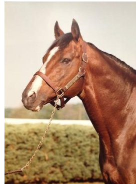
Northern Dancer, first Canadian bred & owned horse to win the Kentucky Derby - 1964