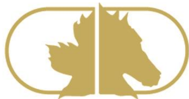
Canadian Horse Racing Hall of Fame

The 250 th Anniversary of Horse Racing in Canada will be overseen by the Canadian Horse Racing Hall of Fame, Canadian Thoroughbred Horse Society – National Office and Standardbred Canada, while providing opportunities for regional organizations, local racetracks, agricultural societies, and horse racing enthusiasts to participate, celebrating the rich heritage of horse racing over the past 250 years. There are thousands of stories waiting to be told from all parts of the country. The 250 th Anniversary provides a great opportunity to bring these stories to the attention of Canadians from all walks of life, allowing us to reach beyond our current racing industry and enthusiasts. It also offers the opportunity for all aspects of horse racing to work together with one common message, and one common purpose.