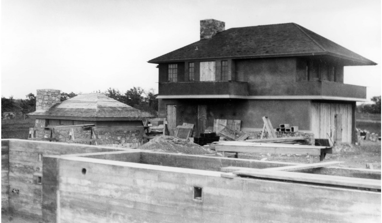
Graycliff under construction – July 5, 1927.

In Brendan Gill's Many Masks biography of Wright, he notes, "It is commonly said of Wright that in designing a house for a client he would brook no interference with what he believed to be in the client's best interests and that therefore the client was obliged to become the silent victim of Wright's aesthetic tyranny. This was sometimes the case but not always; moreover in fairness to Wright it ought to be noted that when a strong-willed client collided with Wright the consequence was often a worse house instead of a better." In the case of Graycliff, a balance was struck that worked for all.