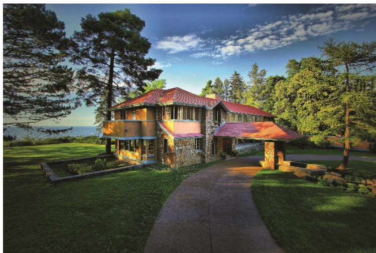
Graycliff's stone massing reinforces its roots in the land upon which it sits.