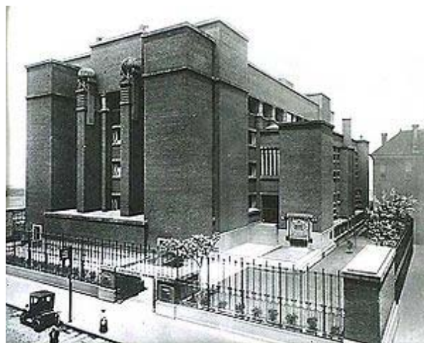
The Larkin Administration building in Buffalo