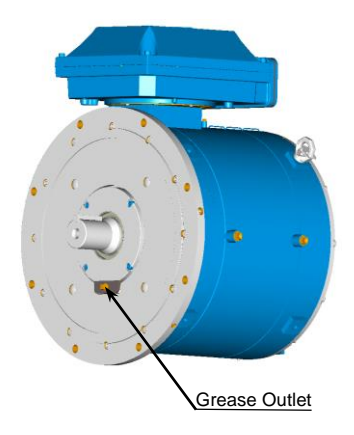
Figure 3. Location of the grease outlet plug in D-end.