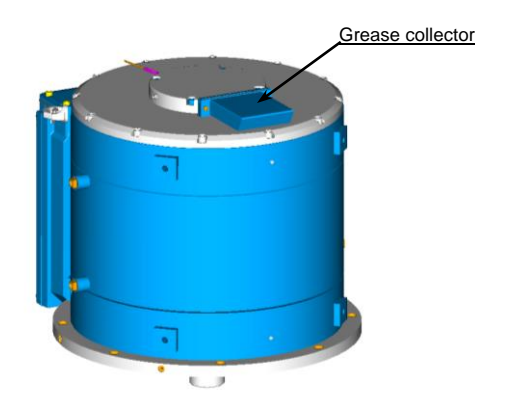
Figure 2. Location of grease collector box in ND-end.