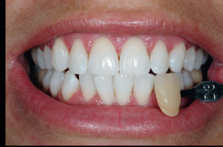
After Enlighten Whitening