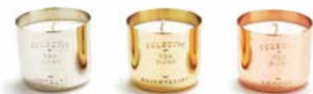
Tom Dixon Candle Set - ECC

Resist the urge to throw away items that don't fit into a cookie-cutter image of what you imagine your ideal style to be. Go with what you love and see how your space takes shape.