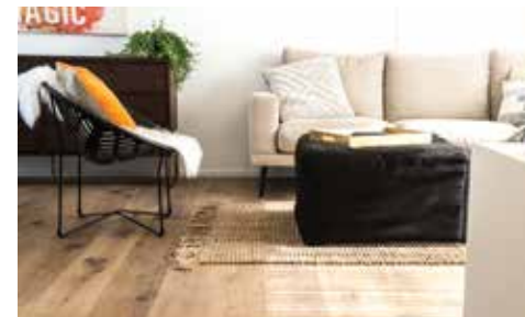
06 - Inside The Block

Inside The Block - Hard work, determination and quality materials pay off for The 2016 Block contestants. 06