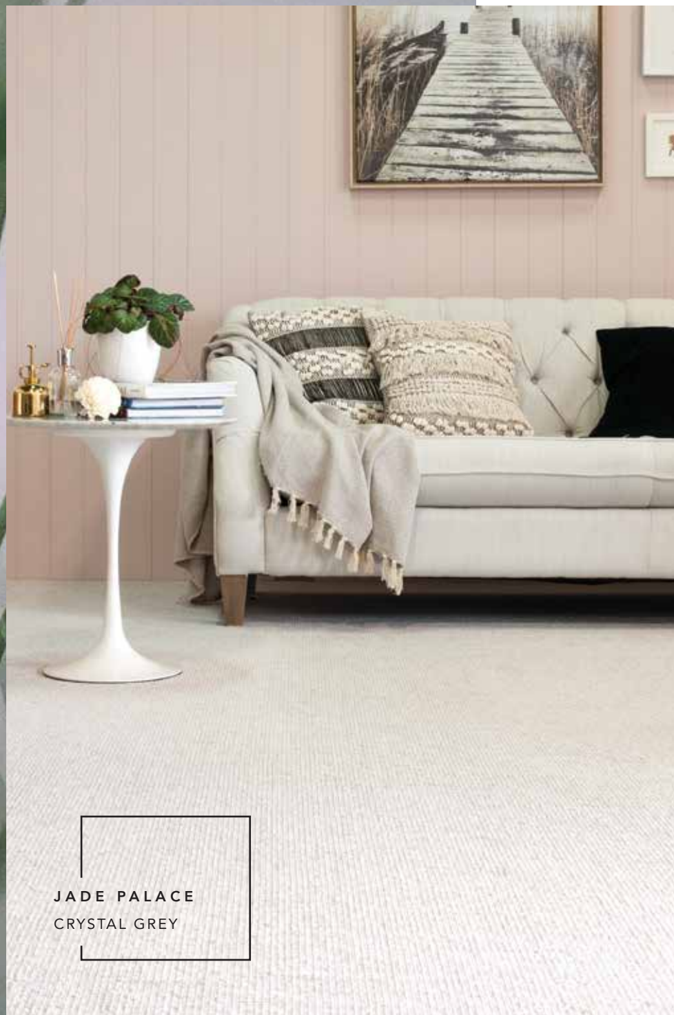
JADE PALACE CRYSTAL GREY