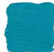
Gus Furniture - Surf