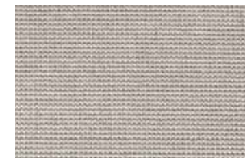
JADE PALACE 4M