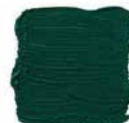
Resene - Midnight Moss