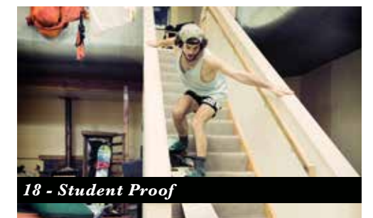
18 - Student Proof

17 Feltex Wool Specials - Simple Clarity - organic-looking materials characterised by delicate simple forms.