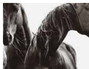
Wild Brumbies by Nick Leary - St Clements

Influenced by Japanese minimalism with no embellishments to detract from its expressive simplicity.