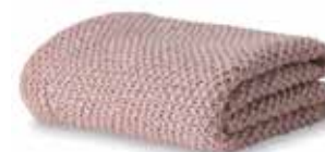
Wool Moss Stitch Throw - Paperplane Store