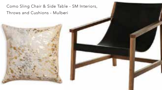
Como Sling Chair & Side Table - SM Interiors, Throws and Cushions - Mulberi