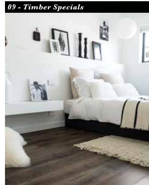
09 - Timber Specials

Timber Specials - Godfrey Hirst Laminate, Bamboo, Timber and Timber Look flooring. 09