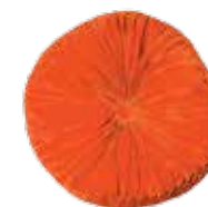
Velvet Cushion - LeeAnn-Yare