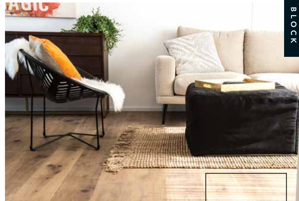
REGAL OAK ASTOR