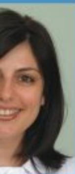
umareva, DDS Orthodontics