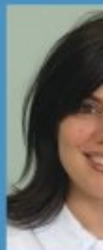
Rada Su D Period