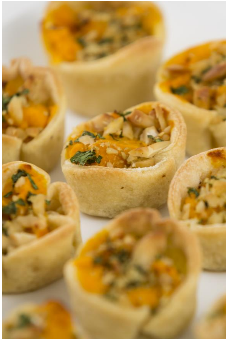
Platters serve 15-20 guests

Kabana, Cheese and Onions Fresh Vegetables Dips and Biscuits