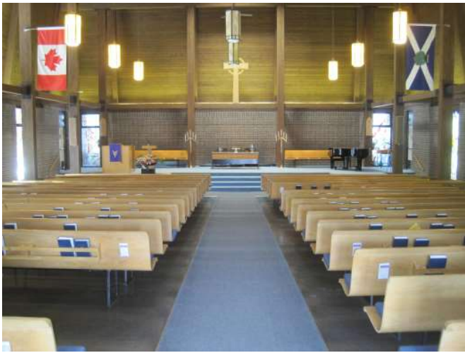
St Mark's Presbyterian