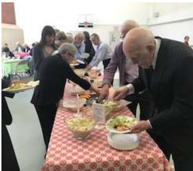
DCUC Congregation in Hospitality and Fellowship.

As the certificate says..." the people of The Donway Covenant United Church Congregation, and the people of Options for Homes, rejoice as we partner to work together over the coming years to build a community of affordable housing and a re-newed church community at 230 The Donway West in Don Mills".