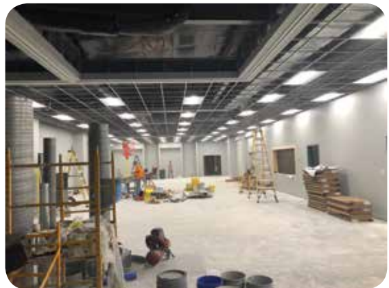
Berean Church in North Platte