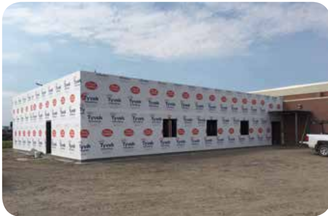
Eustis Wellness Center

Ross Collins is making good process on the Eustis Wellness Center. Ross and crew have the structural steel completed and will be closed in soon.