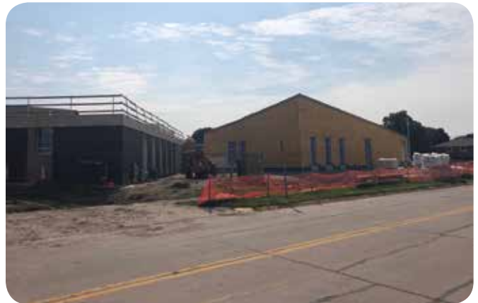
Mount Calvary Lutheran Church

Remember to work safely and efficiently.