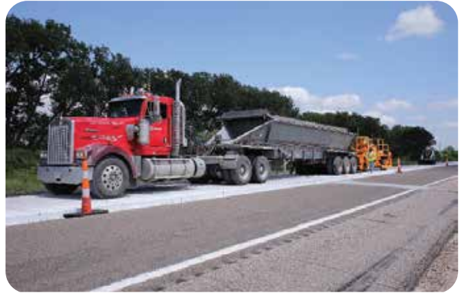
Asphalt paving the shoulders between Brady and Maxwell.