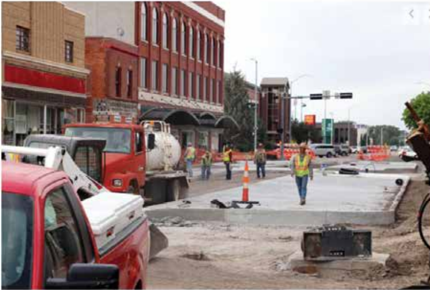
A Paulsen Inc. worker walks north Friday morning on one of the recently laid concrete parking strips on North Platte's North Dewey Street between Fourth and Fifth streets. Behind him, four colleagues continue laying sand where Dewey's 1916 paving bricks will soon be reset atop a 6-inch-deep concrete base that has yet to be poured between the parking strips.