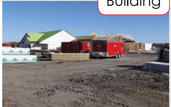
Meadowlark Addition in Cozad