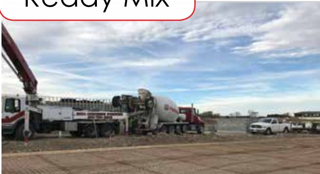
Farm Credit Services in Broken Bow

Hello Everyone! It is been a loooong winter this year, and we are glad to have longer days and more sunshine now! The RM Division is definitely ready to go back to regular work. Cozad, Broken Bow, and Holdrege have been pumping out the precast products, along with support from the other plants, be it help or tying rebar cages. NDOT changed the design of the concrete protection barriers so we had to make new ones this winter, by the end of March we should be close to 700 new barriers. Thank you everyone that has helped in this task, it has actually went pretty well due to your hard work and dedication to make this goal happen!!