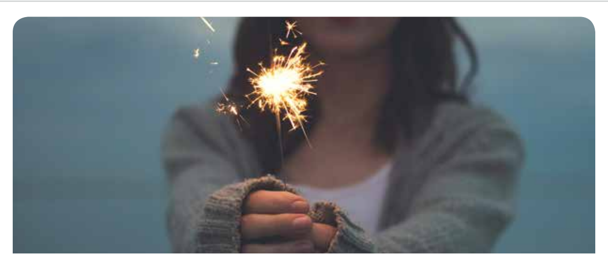
Everyone please work safe this summer and enjoy!