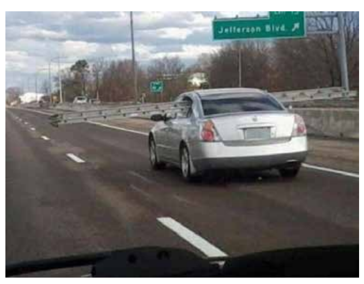
Stop - Look - Analyze and Manage. What could possibly go wrong here? At the very least, he should have a "Danger Wide Load" sign, but he'll likely have a police escort momentarily.