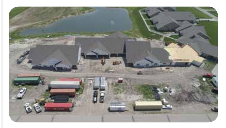
Work is progressing at Meadowlark Pointe in Cozad

Dan Schwarz, Ross Collins, and crew have Meadowlark Pointe dried in. Meadowlark is a very busy job site averaging about 50 craftsmen every day.