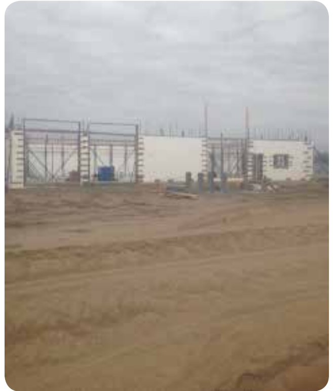
Construction of the new Ready-Mix Facility in Gothenburg.

all of the students and teachers of MPCC.