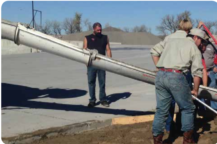
Mid Plains Community College Decorative Concrete Seminar put on by our Ready-Mix division at the North Platte Paulsen Inc. plant.

We did sponsor a decorative concrete seminar for the Mid Plain Community College in North Platte on October 26th. We had about a dozen students from the construction program come over to the plant and learn about coloring and stamping concrete with a hands on demonstration. It was very well received by