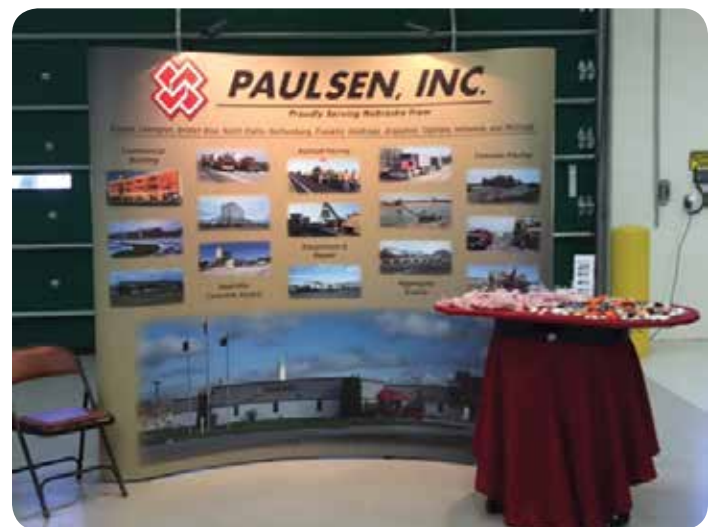
I get the awesome opportunity to represent Paulsen Inc. at Career Fairs and Job Fairs throughout Central Nebraska! I continue to look for top notch students, both in high school and college to fill all of the employment needs we have.

May your Christmas be filled with much joy as you spend time with family and friends! Take time to enjoy each moment!