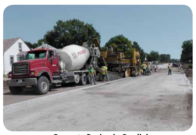
Concrete Paving in Ogallala