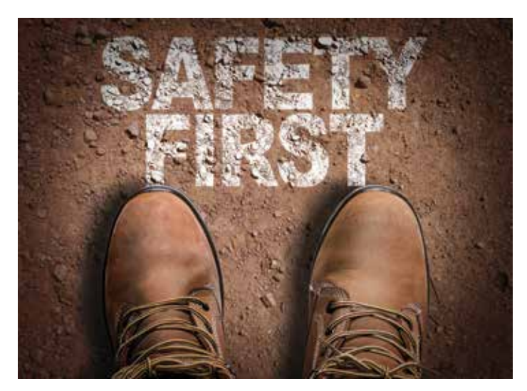
Paulsen, Inc. puts the safety of every employee first. Be sure to do your part to work smart and stay safe!