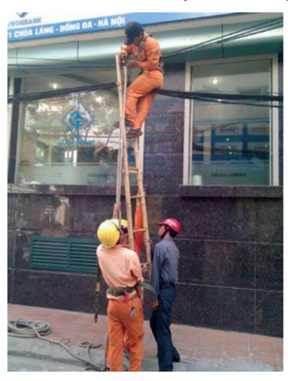
Peace of mind is having trust in your fellow workers and that the electricity is locked out – well. . . probably?