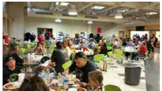
People eat big time at the Annual Spaghetti Dinner sponsored by the South Adams County Fire Dept. at Adams City High School.

Fast Facts: Total budget $2.2 million dollars Construction began: January 2016 and opened August 2016 Located at 10725 Wheeling Street, Commerce City, CO 80022 Park Theme: This 9.5 acre park features a theme inspired by the children's book "The Very Hungry Caterpillar" Designer: DHM Designs Contractor: Goodland Construction