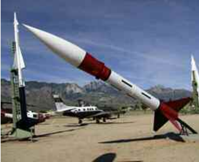
(L) The warheads were transported in this type of vehicle.