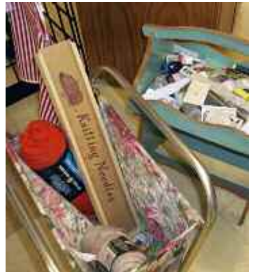
Knitting needles, yarn, buttons, zippers, etc.