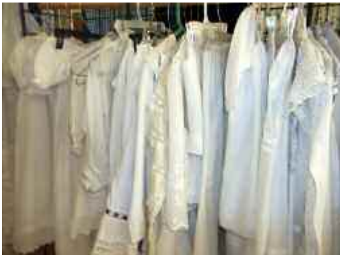
More of the beautiful hand stitched early 19th century clothing items from the Mildred Stites estate.