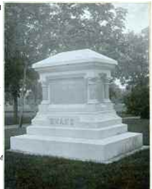
Marker for John Evans, U.S. President Abraham Lincoln appointed John Evans the second Governor of the Territory of Colorado on March 31, 1862.