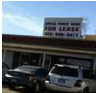
Nick's Market in the Adams City Shopping Center