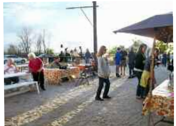
Crowd photo at the Meet the Space celebration. Note the band in the background.

Located at 6601 Colorado Blvd. will open in the Spring of 2017 with a 21,000 sq. ft. bldg. and a second with 14,000 sq. ft. at a later date. Many artists with studios in the Santa Fe Arts District are moving to Commerce City to occupy studios in this facility. This is the former Juhl property. CCHS will have a history display about the Hog Farming in the area during the first half of the Nineteenth Century Watch for more on this project.