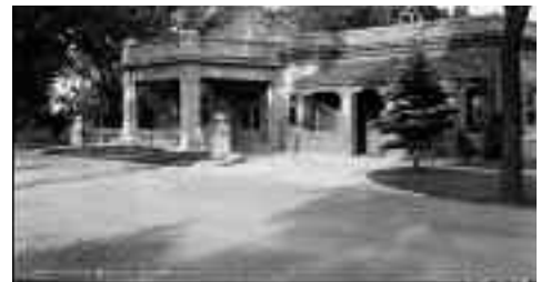
Riverside Office (1936)