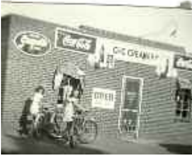
C & C Creamery