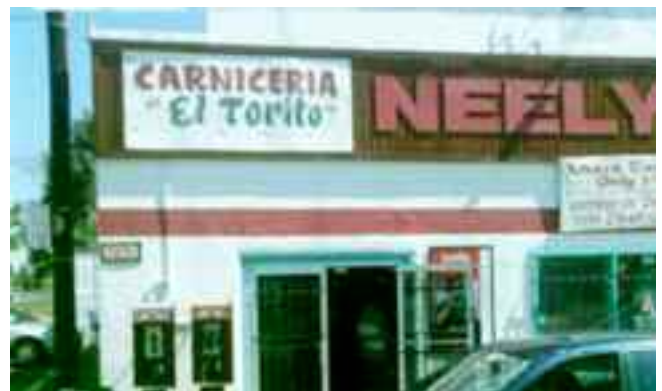
Neely's Carniceria "El Torito" at 60th Monaco