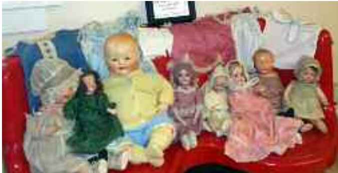
Dolls, dolls, dolls