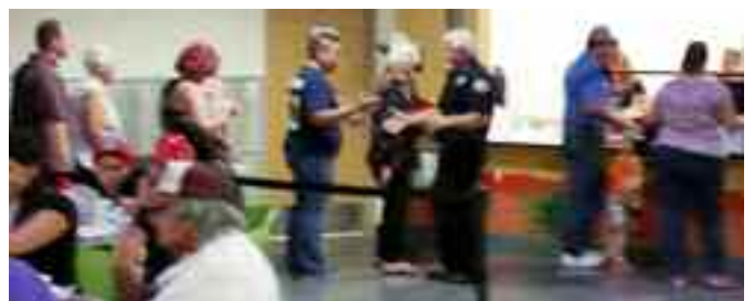
CCHS volunteers greeted guests at the 55th Annual Spaghetti dinner to support the fire department.