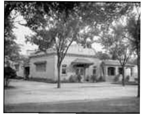
Riverside Cemetery Chapel