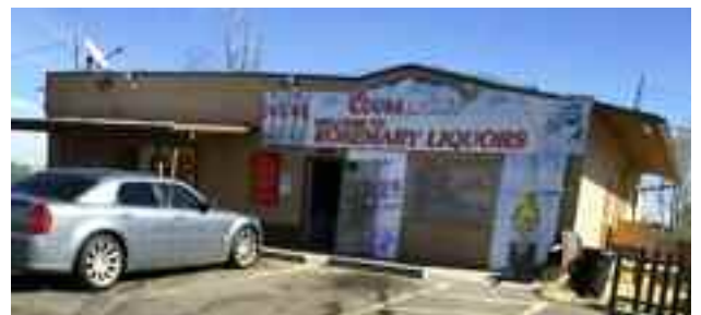
Irondale Grocery & Rosemary Liquors on Rosemary.