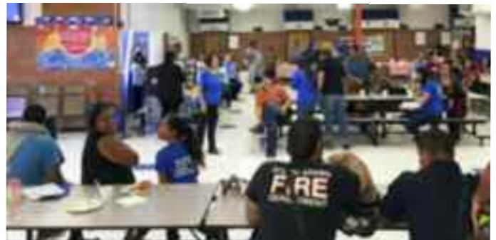
Adams City Middle School Back to School Open House and Pancake Breakfast, Saturday, August 20.