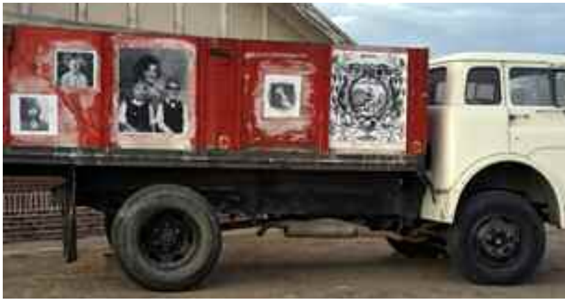
This is an example of some of the displays at Meet the Space on Sept. 30.