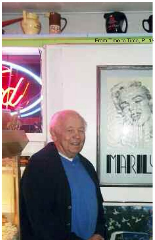
From Time to Time, P. 15