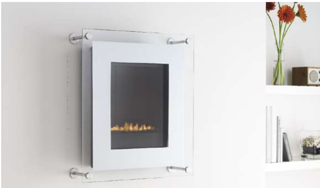
Elite™ CVF shown