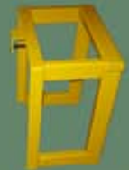
Front Gate Extension