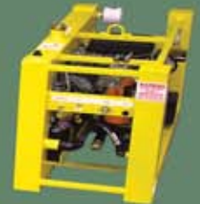
Stationary Hydraulic Power Unit