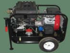
Portable Hydraulic Power Unit