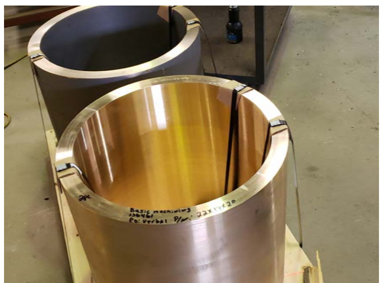
Fabricate 2 - 22" Diameter Bronze Bushings for CN Rail