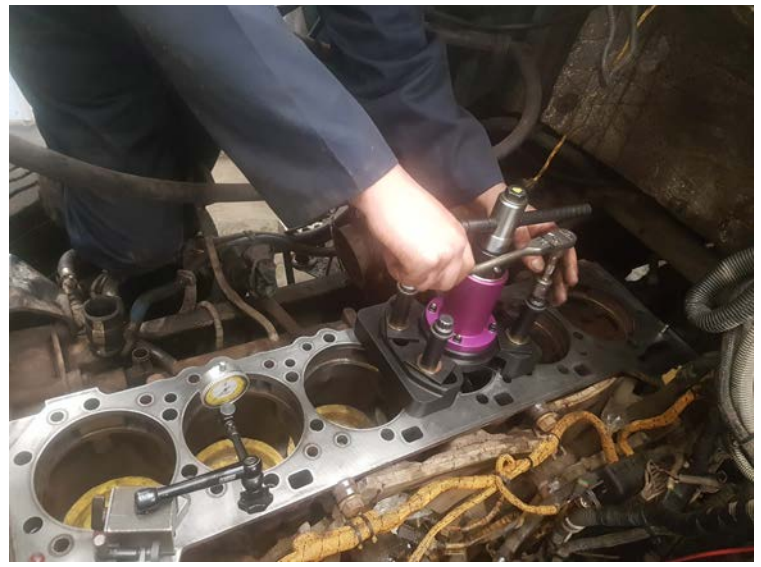
Counter boring of CAT engine block