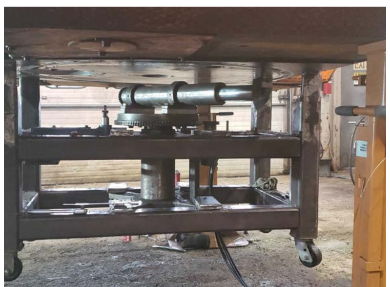
Remachine Swing Bearing Mounting Surfaces - Portable Flange Facing