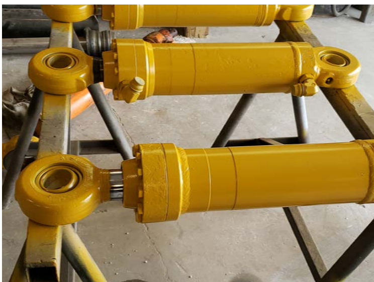
Rebuilding and Fabricating a New Cylinder