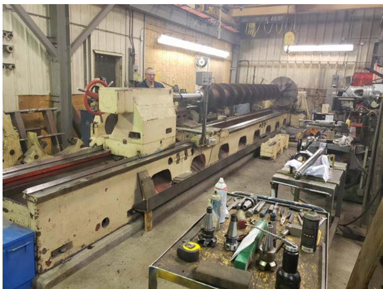
26 Foot Auger Shaft for Domtar Inc.