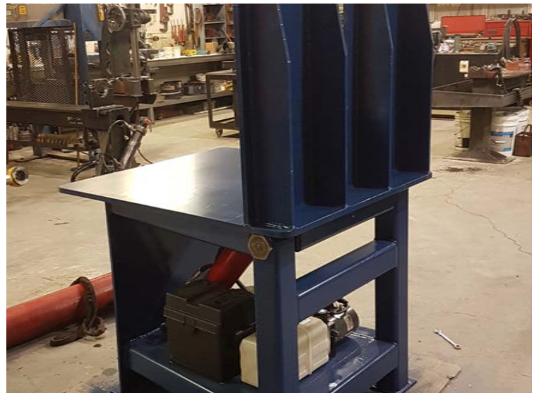
Custom Built Tilting Pump Assembly Table for Domtar Inc.