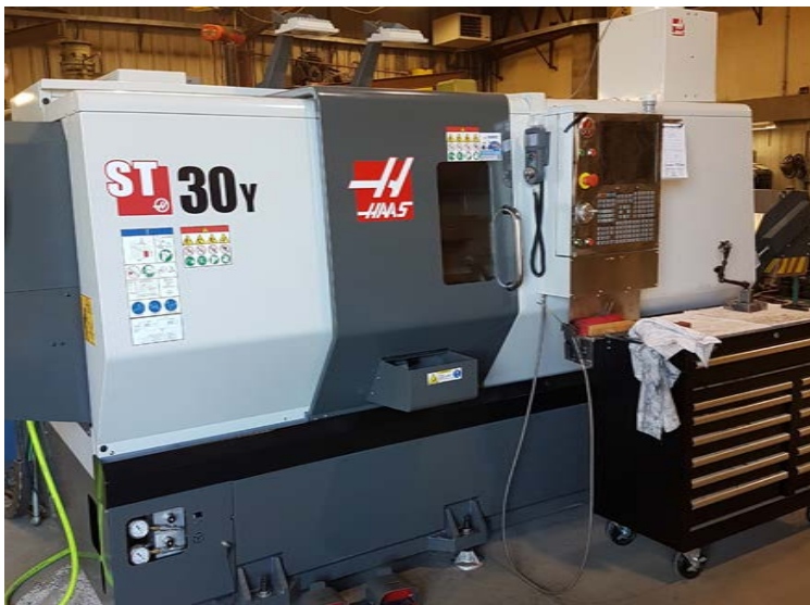
CNC Lathe Capabilities