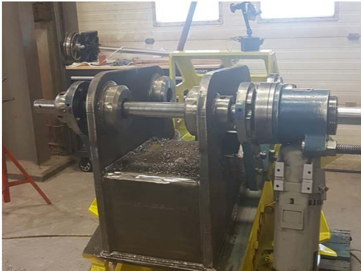
Portable Align Boring