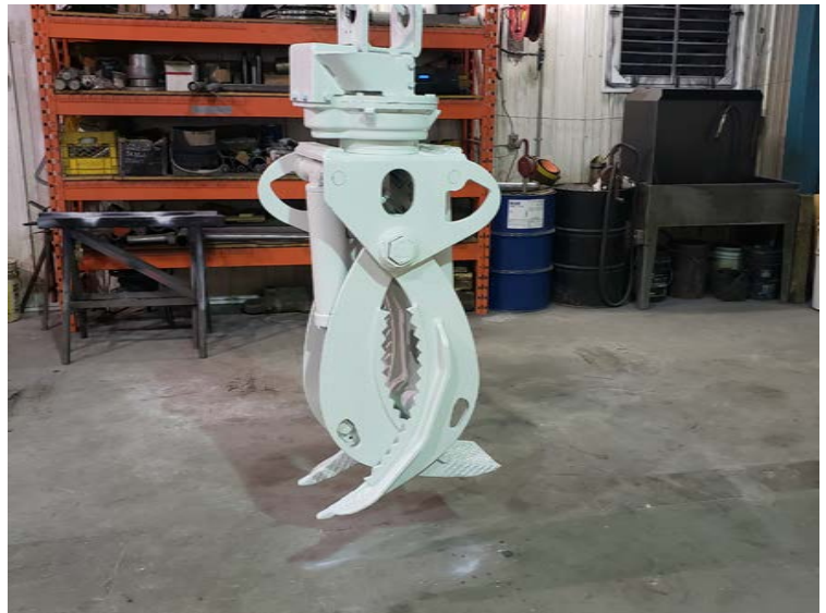
Chipper Clam Rebuild