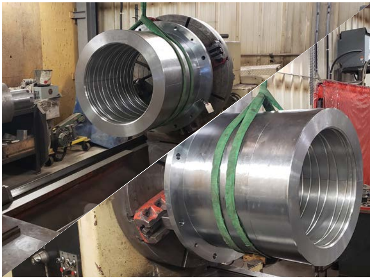
Split Bushings with 32 Inch Diameter - Newmont Goldcorp