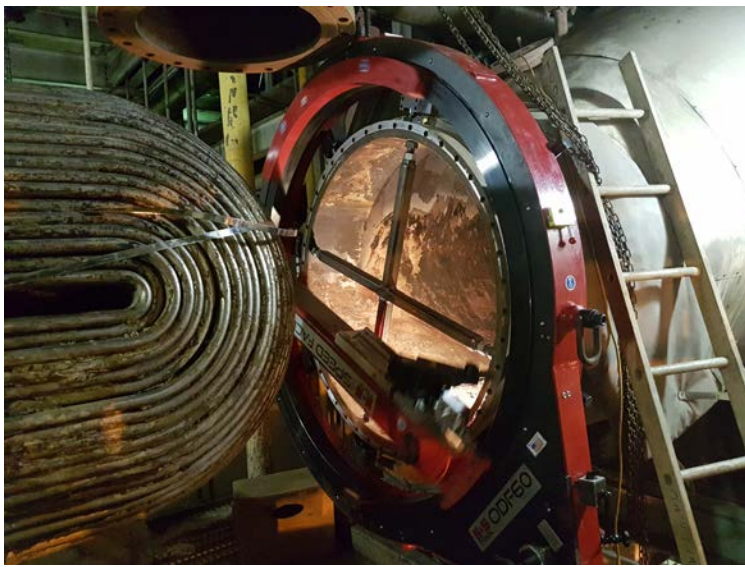
Portable Flange Facing