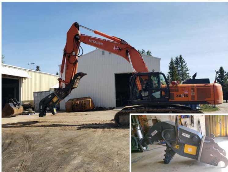
Fabricated Quick Attach Mount for Concrete Pulverizer