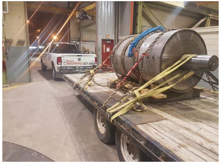
Large Roll Repairs for Domtar Inc.