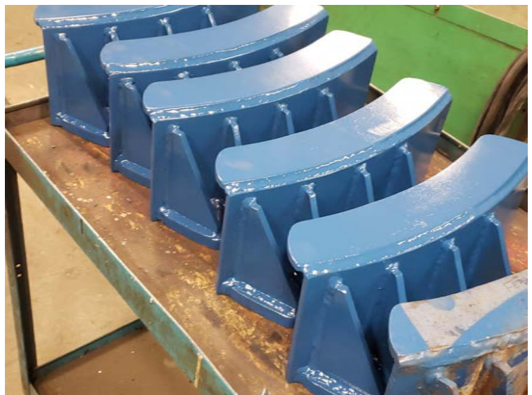
Fabrication of New Chipper Components