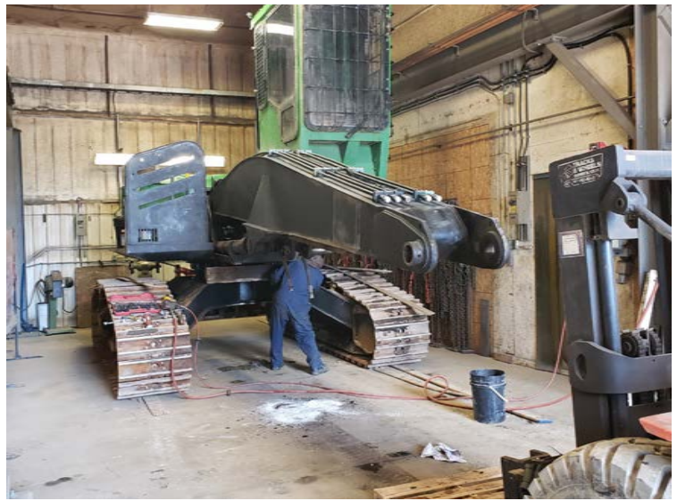
Dismantle and Rebuild Heavy Equipment Components