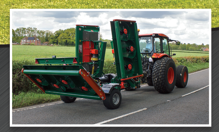
Superb for road travel