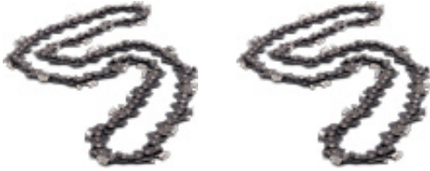
576 93 65-52 Saw chain H37 3/8" MINI Pitch 1,3 mm

achived by using bonding materials over the entire surface as supposed to previous techniques. The bar is also less susceptible to bending and returns to its original shape when subjected to high loads. Gives you less strain, increased efficiency and gain a higher productivity without compromising on the quality of the cutting equipment or user safety.